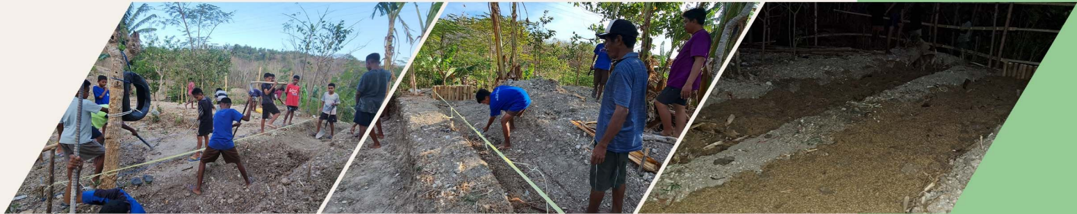
1. Construction of raised beds.

The process involved the following steps: