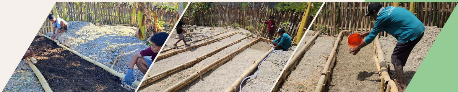
4. Second Fertilization: Application of livestock manure.