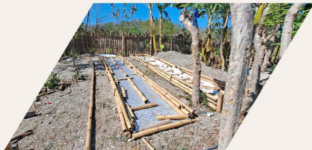
7. Fermentation period.