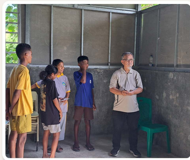
eye test (color blindness test and snellen chart)