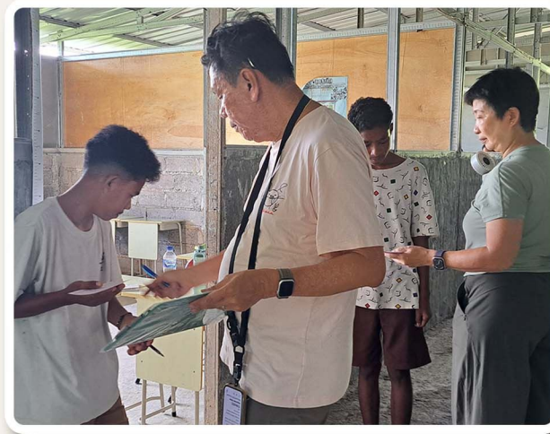
BMI check (body weight and height)