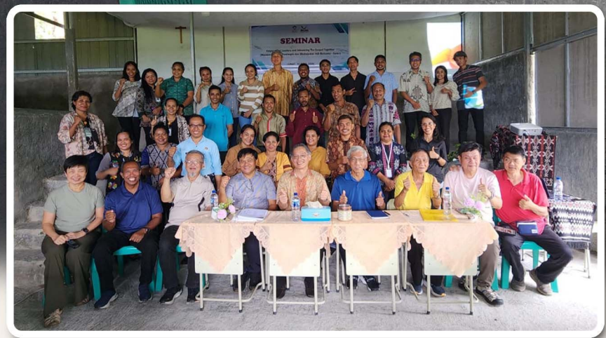
Leadership Seminar with additional general health screening from the Team I.L.I (International Leadership Institute), Singapore