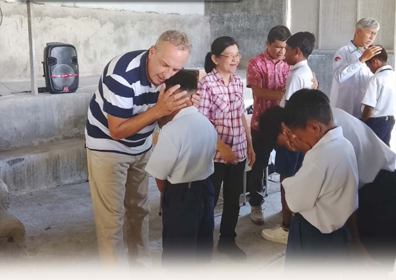
Visitation and Support from GSJA Siloam-Kayu putih, and Team from Australia