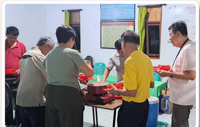
dinner together with the I.L.I team